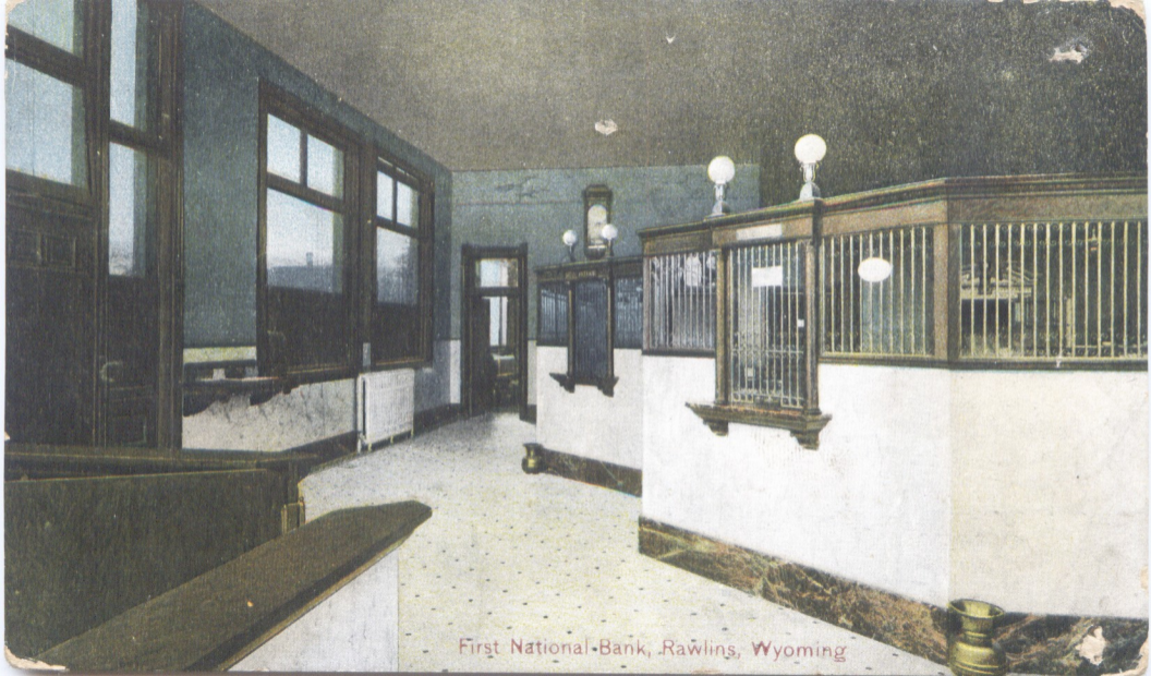
First National Bank, Rawlins, Wyoming